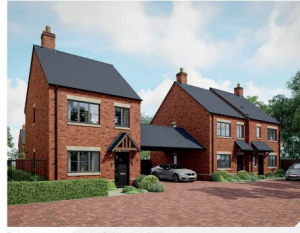
The above computer generated image of Plot 1 is based on the layout property.